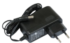
24V 0.38A Power adapter